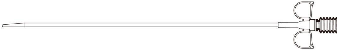
An illustration of the PerClot® laparoscopic

Used in laparoscopic and laparoscopic-assisted procedure.