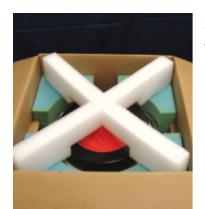
Step 3: Replace all blue foam corner pads and white foam cross pads. Include any unused paperwork. Close the flaps of the box and tape the box closed.

Step 2: Replace the lid on the container to ensure the vent holes in the side of the lid line up with the vent holes in the neck of the shipping container.