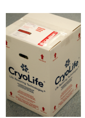
The shipment will be packaged as shown here and delivered via approved courier, FedEx<sup>®</sup>, or UPS<sup>®</sup>.

Step 1: Take notice of the date/time stamp which is located on the upper left corner of the envelope taped to the top of the box. It represents the expiration date/time (Eastern Time) for the shipment. Please ensure that the allograft(s) will be thawed for implantation, placed in a low temperature storage freezer (at or below -135°C), or returned to CryoLife<sup>®</sup> before the expiration date/time.