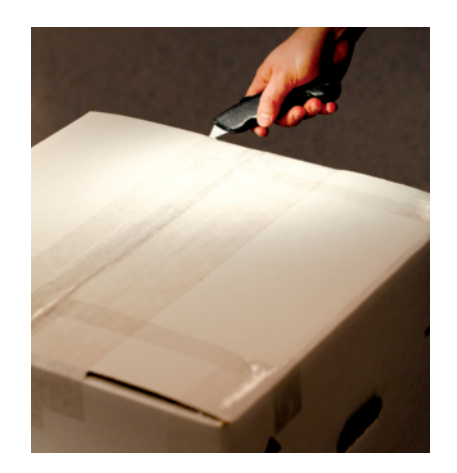
Step 4: Cut the tape and open the flaps of the box. Do not remove the shipping container from the box.