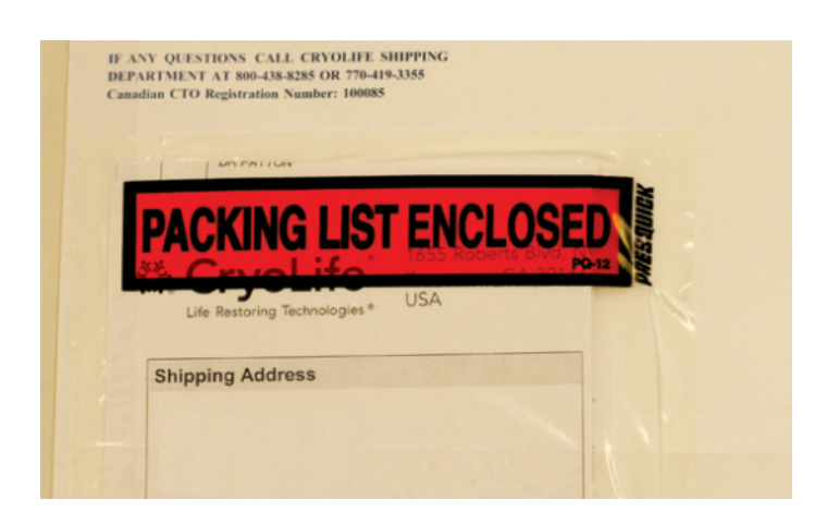
Step 3: Remove the Packing List from the sleeve attached to the outside of the box. This List contains the allograft type, size, quantity, and purchase order number.