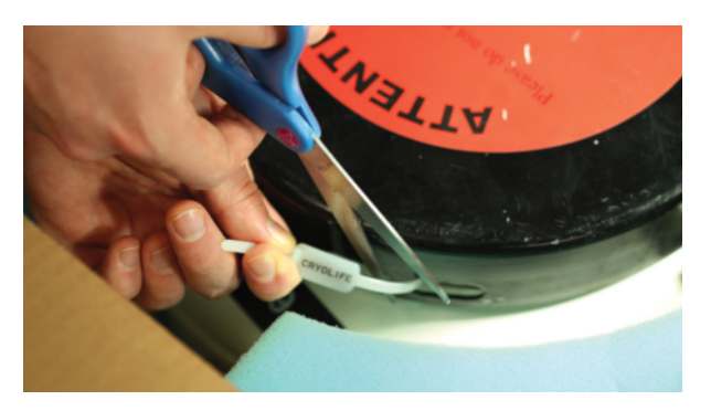
Step 6: Refer to the instructions on the lid before opening the shipping container. Cut the CryoLife cable tie to open the lid of the container.

NOTE: The impact of completing Step 6 and cutting the CryoLife cable tie is in the Returns Policy at www.cryolife.com/returnpolicy